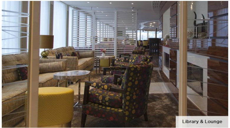
Library & Lounge