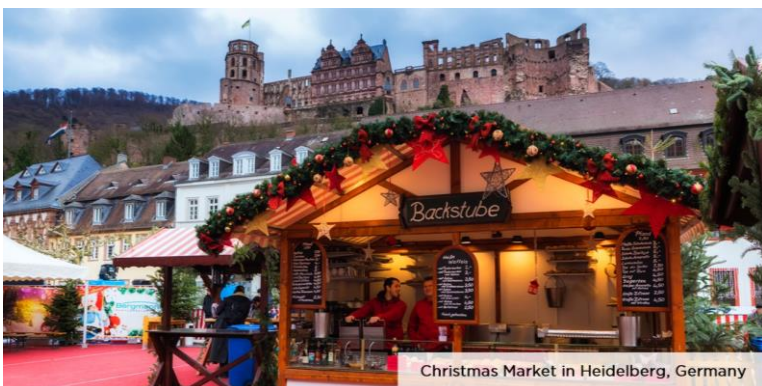
Christmas Market in Heidelberg, Germany

Optional Land Packages Pre-cruise 2 Nights Zurich & 2 Nights Lucerne from $1,760 per person *Upgrade not applicable to solo travelers.